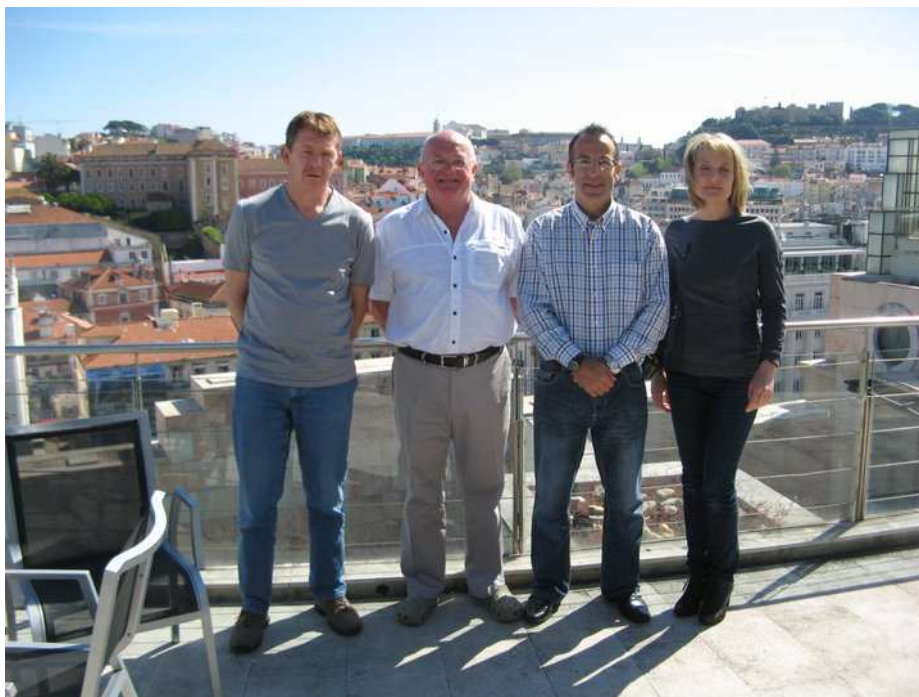
IFEH Group: Meeting in Lisbon Portugal

but also helps in saving the environment from global warming hence a comfortable environment for human health.