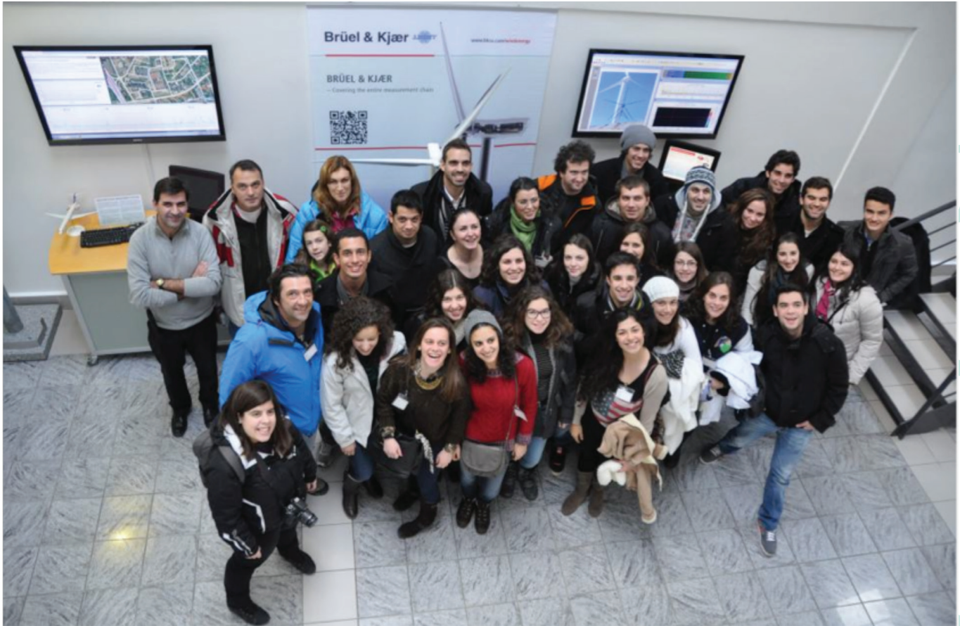
Coimbra Health School students visit Bruel and Kjaer